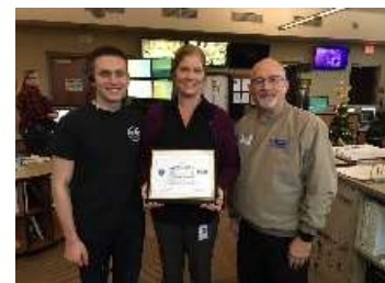
Dispatch Patriot Award